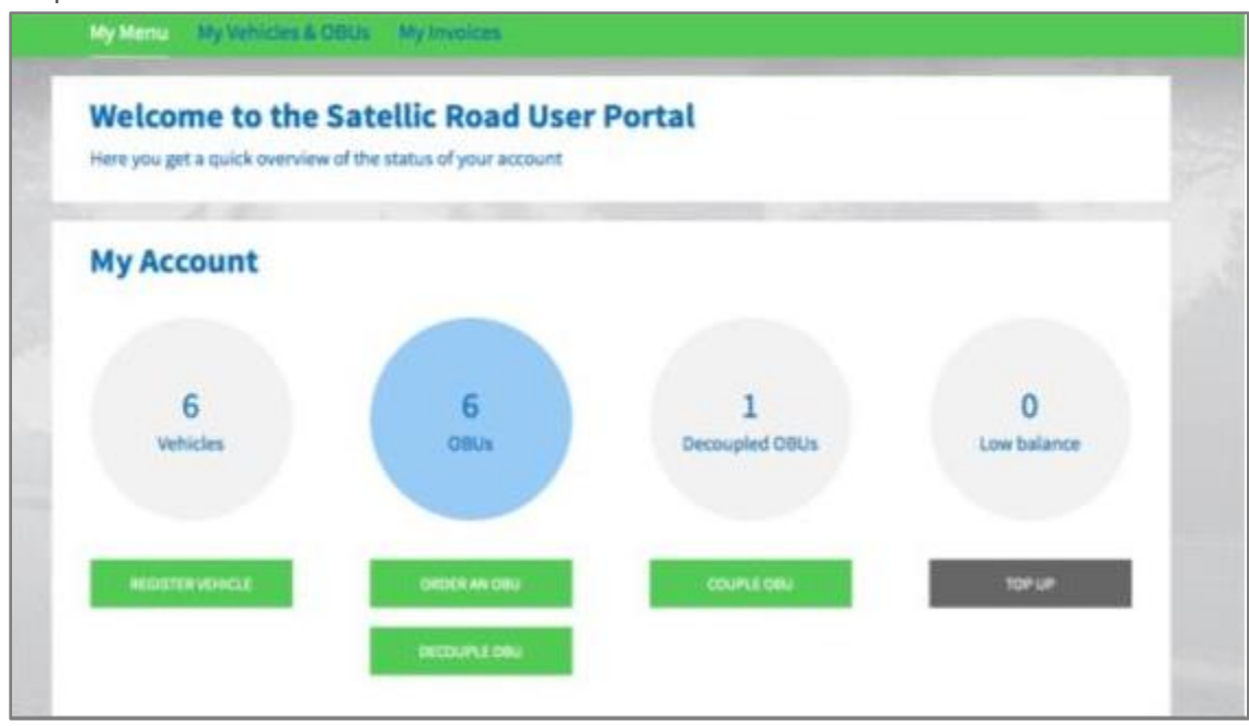
Step 4: Select the blue circle "OBUs"

Step 5: Select the OBU for which you want to change the payment means.